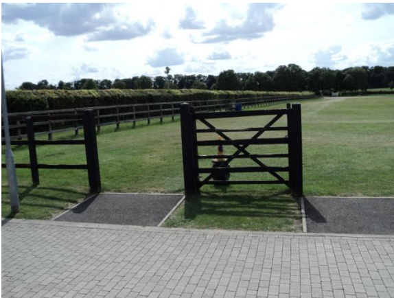
Garden and Grandstand and Paddock Enclosure accessible parking

Garden and Grandstand & Paddock Enclosure parking is situated within the red car park, the blue badge holder parking bays are situated at the front of the car park along the fence line and are accessible through Gate 4 off the Cambridge road. The car park is an open area with a grass surface; it is accessible to a wheelchair user although assistance may be required as there are areas of grass to manoeuvre.