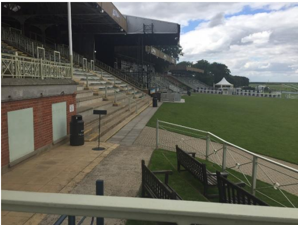
View of Stage from platform A

For music events access to the viewing platforms (A, B and C) is to be arranged in advance by contacting the Customer Relations Team on 01638 675500 (Opt 4). The booking system will be under taken on a first come, first served basis. Passes to access each ramp will be issued when the personal assistance ticket is collected from the Free Pass Office, it is recommended to make your way to the viewing ramps in good time due the area becoming busy during concert phase. Family Enclosure customers who have pre booked these viewing platforms will be given access to move up before the penultimate race to ensure a clearer passage. Admission onto the platforms on the day without prior booking cannot be guaranteed.