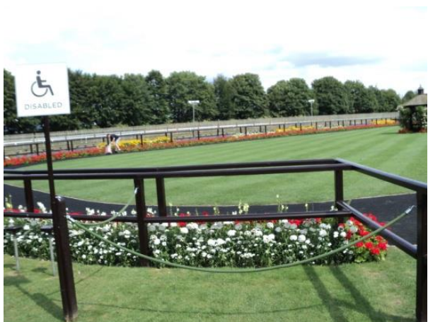
Parade Ring Viewing Area

Parade Ring Viewing: For viewing the parade ring there is sectioned off area on the corner of parade ring side behind Stand 1 and next to the horse walk to the Winner's Enclosure.