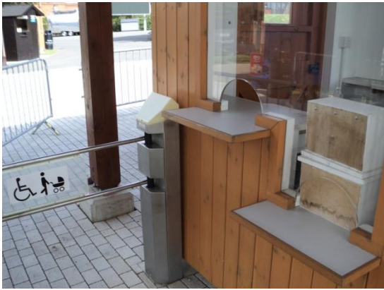
Grandstand & Paddock entrance

Premier Entrance 2 has level access with a paved surface. The main doors are single width (90cm) and open automatically. There is a lowered operation window. These access points are situated on the left hand side of the gate entrance. On race days there is a member of staff situated at the entrance to provide assistance.