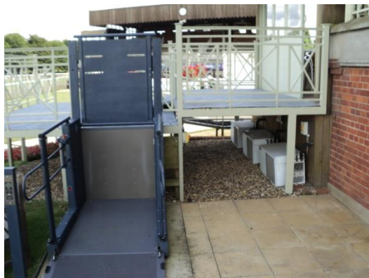
Viewing platform next to integrity tower Accessible lift to viewing platform next to integrity tower

A second platform is located in Premier enclosure trackside in front of the Stand 2 (Platform B). Access to the platform is via a slope with a moderate gradient to the level platform.