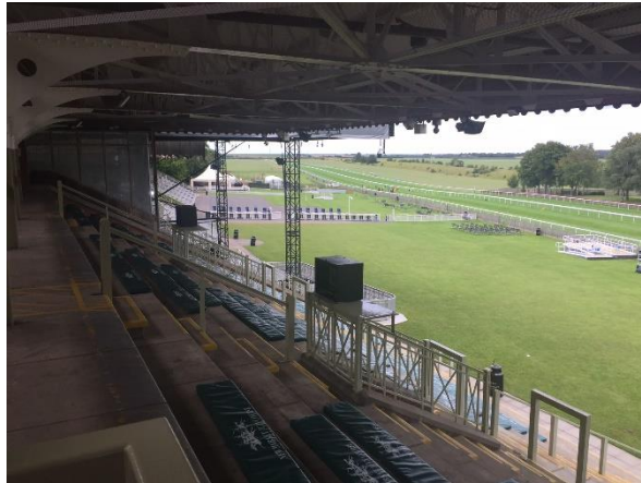
View of Stage from Area E

Spaces on the platforms and within the reserved areas include one disabled visitor with one accompanying personal assistant. No other visitors can be accommodated on the platform/in the areas.