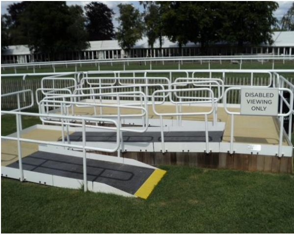
Viewing platform (C)