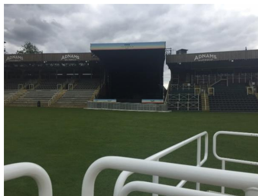
View of stage from platform C