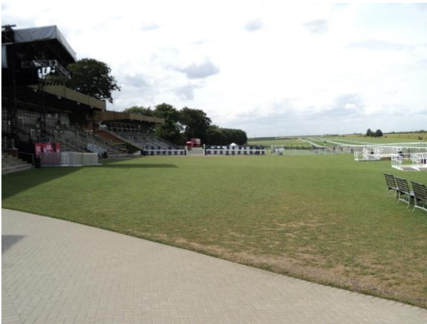
Racecourse side in the Premier Enclosure

Access around the July Course is accessible to people with mobility issues and wheelchair users. There are paved and tarmacked routes covering the venue from the entrances to behind the grandstands. There is a hard standing paved pathway located in front of the Grandstands in the Premier Enclosure. Please note that the rest of the area racecourse side of the grandstand is fine turf. The area for the concert phase can become very congested with people standing to view the concert.