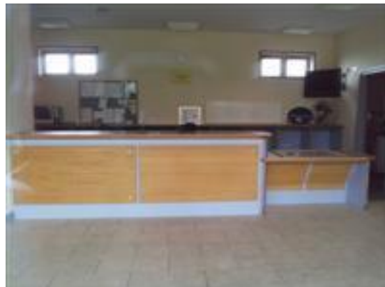
Inside Course Office

Accessible Toilets: There are three accessible toilets located around the perimeter of the Grandstand and Paddock enclosure. One is located next to the Soviet Star Bar, one opposite the Height of Fashion bar and another opposite the Royal Academy bar and next door to the Fish & Chip shop. All three accessible toilets have doors opening outwards (pull) with a width of 85cm. There is clear manoeuvring space in each one with minimum dimensions of 150cm x 200cm.