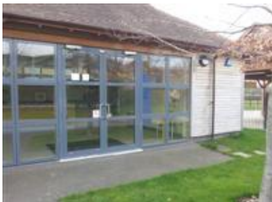
Course office Entrance

The course office/information point is located in the Grandstand & Paddock Enclosure, beside Premier Entrance 2. There is level access and a tarmacked surface around it. The main doors are double width (180cm) and open towards you (pull). On race days there is a member of staff stationed there to provide assistance. The reception desk is located 3m away from the main doors with level access on a tiled surface. The reception desk is at medium height with a lowered operation section to the right hand end.