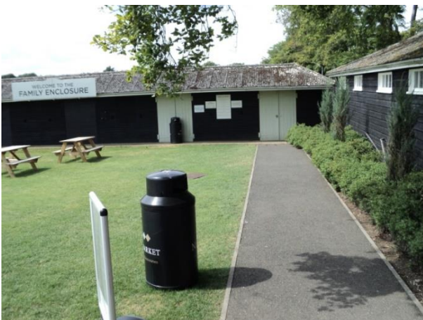
Garden Enclosure Entrance

The Garden Enclosure entrance is situated at the far end of the venue and all access is on level ground towards the entry gate. There is however some grass areas to navigate. The main doors are double width (150cm) and open towards you (pull).