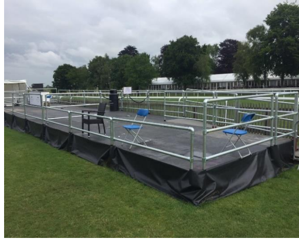
Viewing Platform (B)

For music events access to the viewing platforms (A, B and C) is to be arranged in advance by contacting the Customer Relations Team on 01638 675500 (Opt 4). The booking system will be under taken on a first come, first served basis. Passes to access each ramp will be issued when the personal assistance ticket is collected from the Free Pass Office, it is recommended to make your way to the viewing ramps in good time due the area becoming busy during concert phase. Family Enclosure customers who have pre booked these viewing platforms will be given access to move up before the penultimate race to ensure a clearer passage. Admission onto the platforms on the day without prior booking cannot be guaranteed.