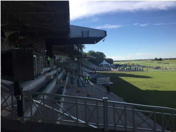
View of Stage from Area D

Disabled customers with non-mobility issues can view the music in 2 reserved areas within the Grandstands. Spaces within these areas must be arranged in advance. Both areas can be accessed via a lift but there may be some steps that will have to be negotiated. Area D is located in the old stage area of Grandstand 2 and Area E at the back of the stepping in Grandstand 2.