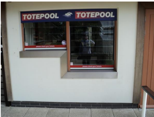
Example lowered Tote service desk

We apologise in advance that The Carroll Restaurant in Grandstand 4 is only accessible via a staircase as there is no lift available in Grandstand 4.