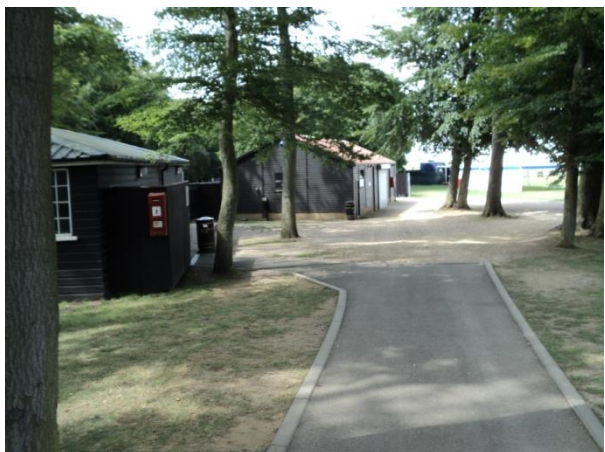
Inside of Garden Enclosure Entrance

Accessible Toilets: The Garden Enclosure has an accessible disabled toilet located in its toilet block. There is one toilet for female use and another for male use. Both of which have level access for entry. The door opens outwards (pull), and has a width of 85cm. The dimensions of the toilet are 150cm x 225cm allowing for manoeuvring space. Access to this toilet is level although a gravelled area needs to be passed over to get to the toilets. A temporary disabled toilet unit is in place within the enclosure for large sell out events.