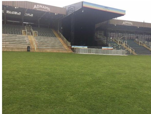
View of Stage from platform B