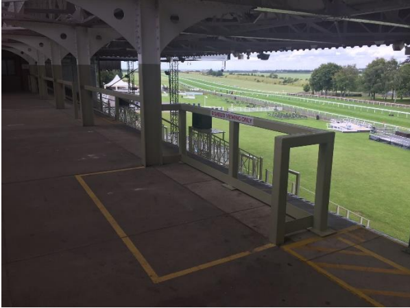
Viewing Area E from top of Stand 2 (Premier Enclosure)

The lift in Premier Enclosure Stand 2 is located beside the Queens Room. This room is accessed on the right hand side of Stand 2 (Winners Enclosure end) over a paved pathway. The lift can be used to access the accessible toilets on level 1 and the undercover viewing terrace on level 2 (Area E).