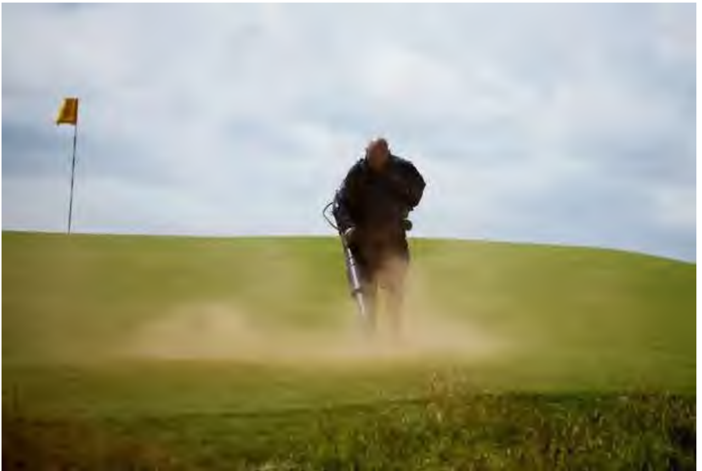
📷 A member of the groundstaff clears the orange powder from the 17th green.

It is not the first time Hoylake has been hit by protests. In 2006, Fathers 4 Justice campaigners threw dye on the 18th green as Tiger Woods approached.