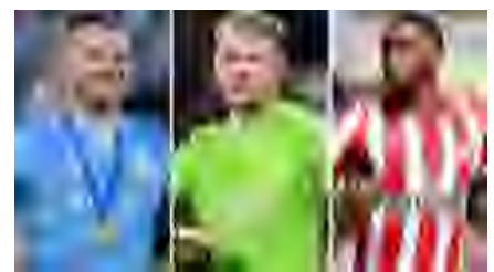
Who could be on the move in January?