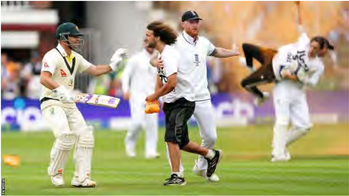
One protester was blocked by David Warner and Ben Stokes