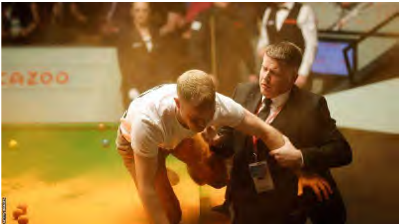
Just Stop Oil previously held a protest around the day of the London Marathon in 2022

Just Stop Oil says it will "continue disrupting cultural and sporting events" amid concerns protestors will target the London Marathon on Sunday.