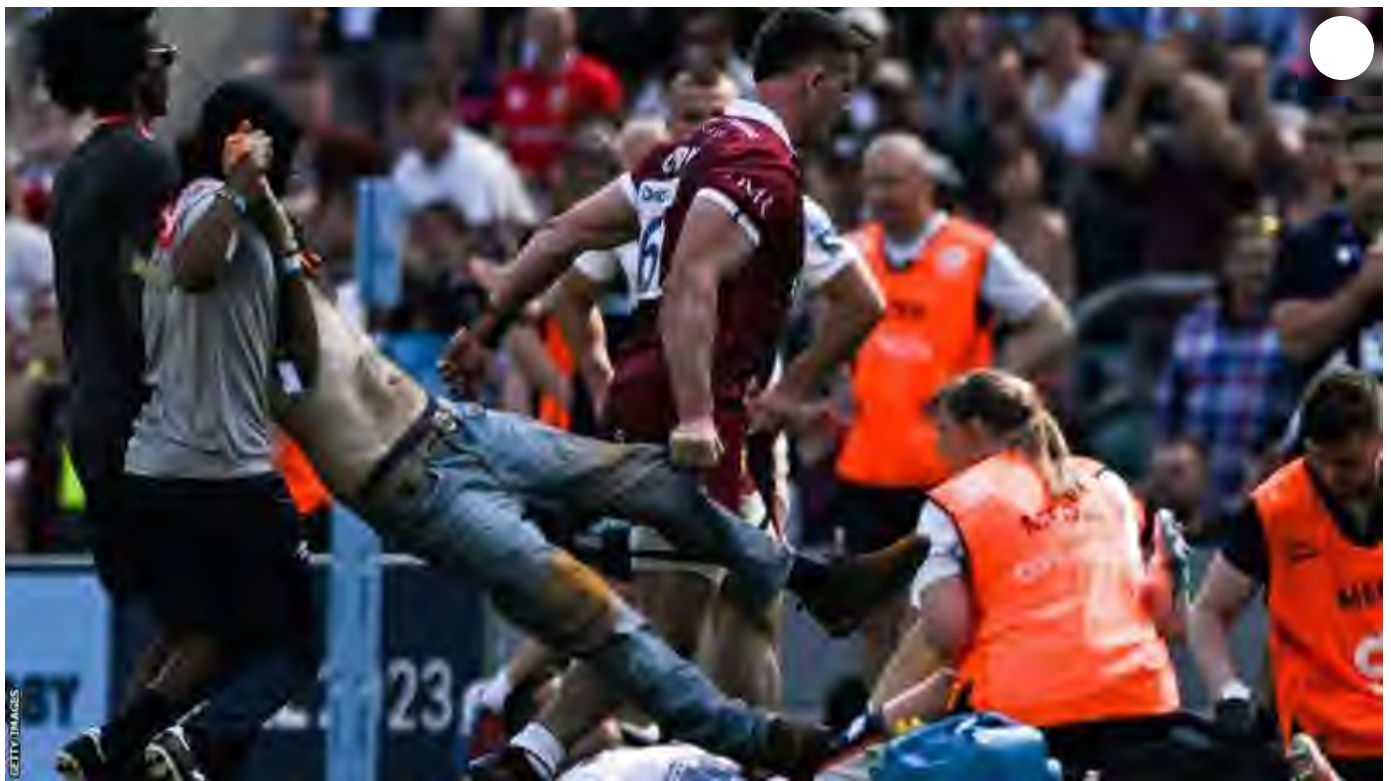
A Just Stop Oil protestor is escorted off the pitch after disrupting the Gallagher Premiership final between Saracens and Sale at Twickenham

Just Stop Oil protesters caused a stoppage to rugby's Gallagher Premiership final by running on to the pitch and throwing orange paint powder.