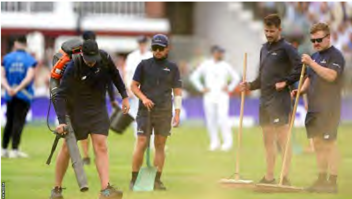
The orange powder was quickly cleared by groundstaff