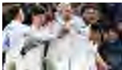
EFL: 34 games in Championship, League One