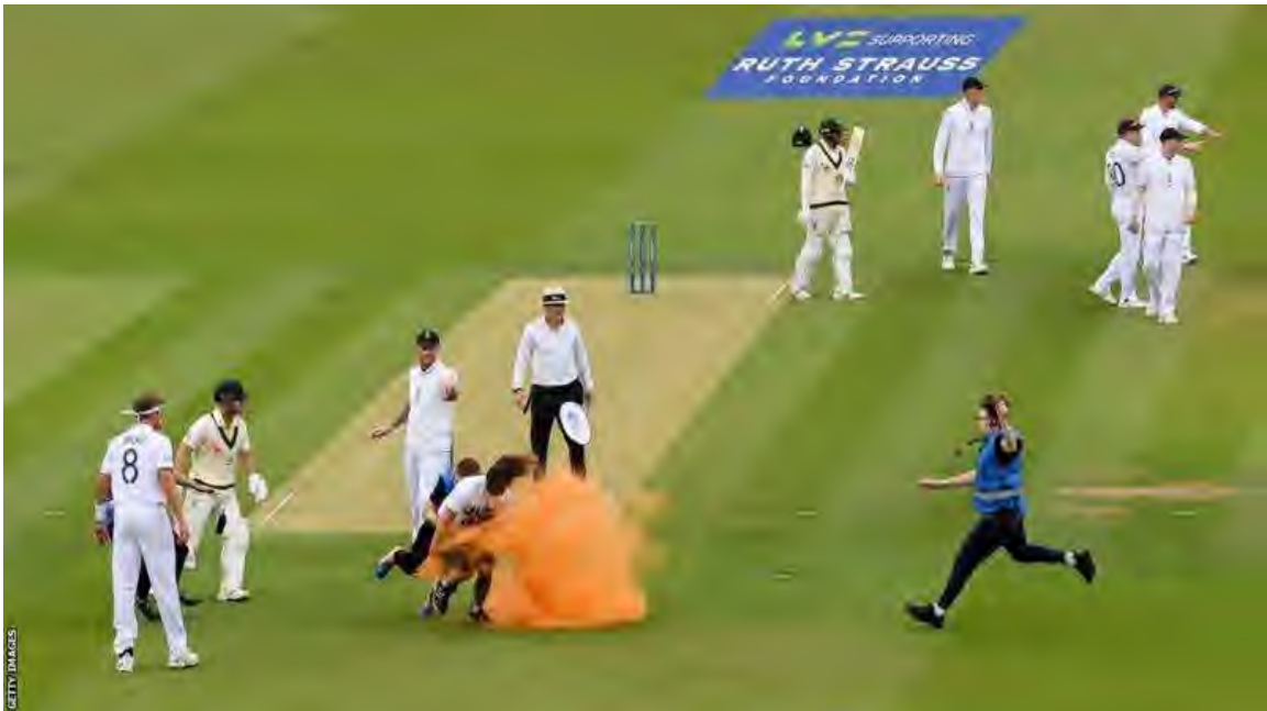
Initially confronted by the players, the protesters were also tackled by security staff