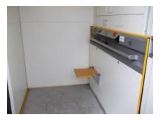
Example interior of access lift

The lift to access the high level walkway is located in the middle of the Premier Enclosure underneath the walkway. It can be used to access the Stravinsky's Bistro and Mozarts Restaurant.