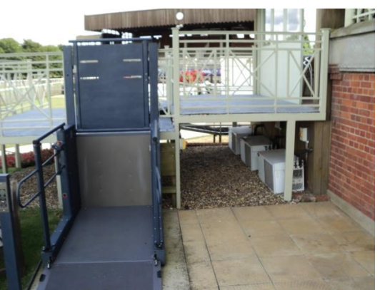
Viewing platform next to integrity tower