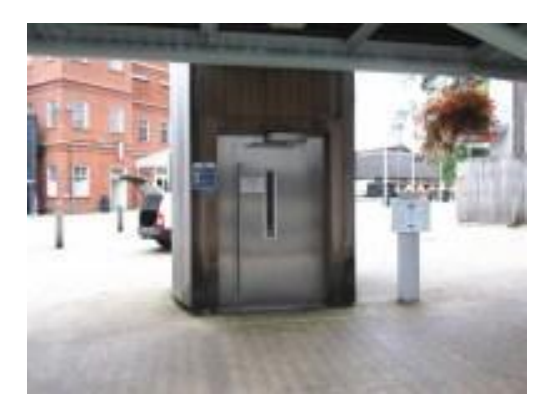
Access lift to high level walkway

There is an accessible lift within Grandstand 3. To access this lift, there is a permanent downward slope located behind the grandstand to the left of the main entrance to the Adnams Southwell Bar. Once inside the access lift can be found on the right hand side. This lift provides access to all levels of Stand 3, including the accessible toilet on the first floor, and the private boxes on level 2.