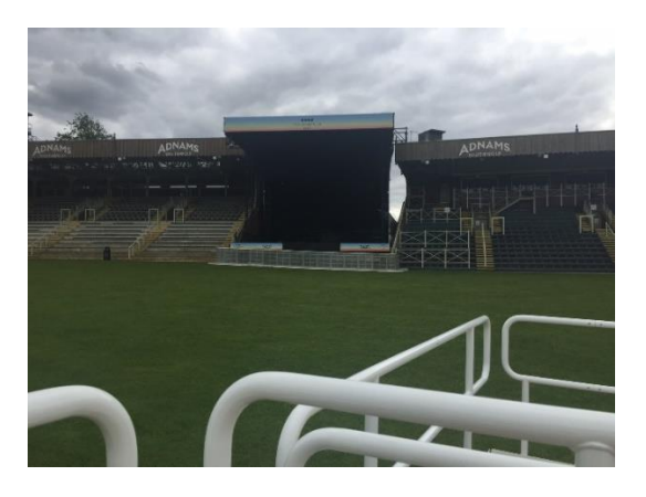
View of stage from platform C