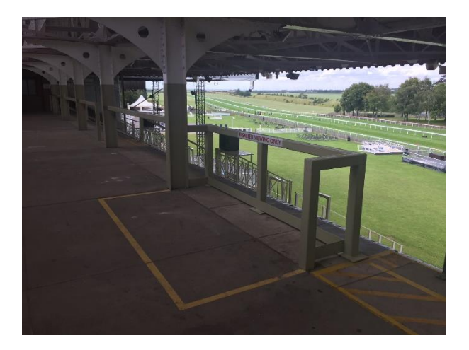
Viewing Area E from top of Stand 2 (Premier Enclosure)

The lift in Premier Enclosure Stand 2 is located beside the Queens Room. This room is accessed on the right hand side of Stand 2 (Winners Enclosure end) over a paved pathway. The lift can be used to access the accessible toilets on level 1 and the undercover viewing terrace on level 2 (Area E).