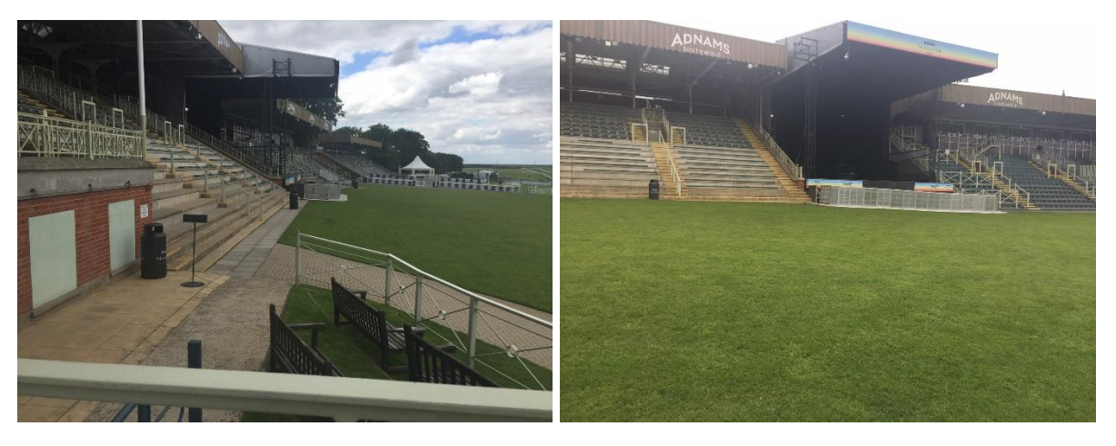
View of Stage from platform A

For music events access to the viewing platforms (A, B and C) is to be arranged in advance by contacting the Customer Relations Team on 01638 675500 (Opt 4). The booking system will be under taken on a first come, first served basis. Passes to access each ramp will be issued when the personal assistance ticket is collected from the Free Pass Office, it is recommended to make your way to the viewing ramps in good time due the area becoming busy during concert phase. Family Enclosure customers who have pre booked these viewing platforms will be given access to move up before the penultimate race to ensure a clearer passage. Admission onto the platforms on the day without prior booking cannot be guaranteed.