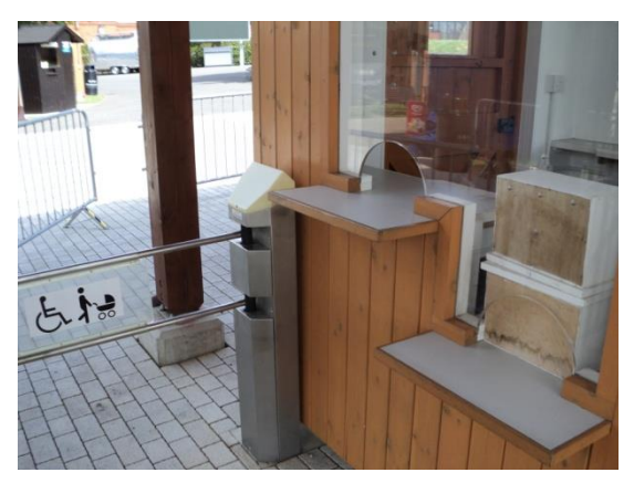
Grandstand & Paddock entrance

Premier Entrance 2 has level access with a paved surface. The main doors are single width (90cm) and open automatically. There is a lowered operation window. These access points are situated on the left hand side of the gate entrance. On race days there is a member of staff situated at the entrance to provide assistance.