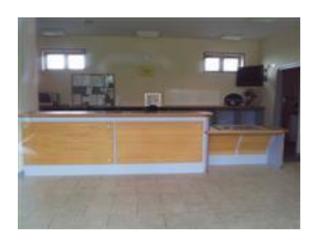
Course office Entrance