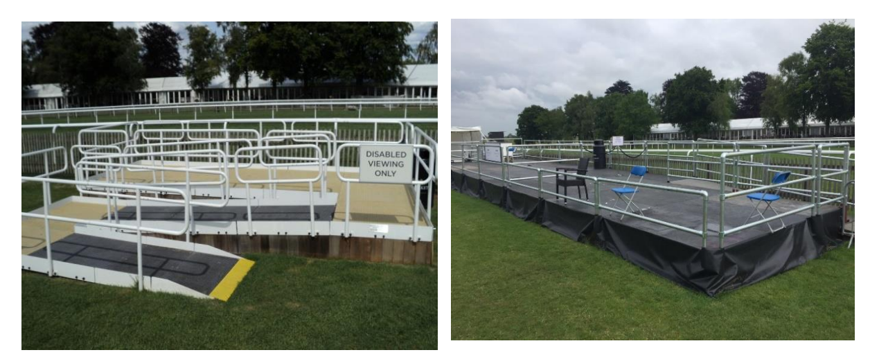
Viewing platform (C)