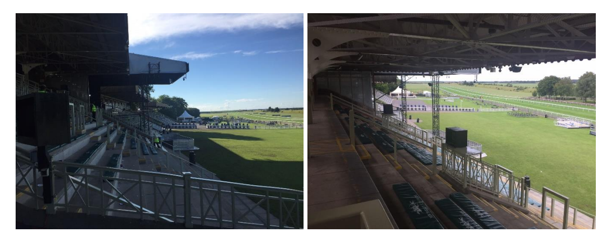
View of Stage from Area D

Disabled customers with non-mobility issues can view the music in 2 reserved areas within the Grandstands. Spaces within these areas must be arranged in advance. Both areas can be accessed via a lift but there may be some steps that will have to be negotiated. Area D is located in the old stage area of Grandstand 2 and Area E at the back of the stepping in Grandstand 2.