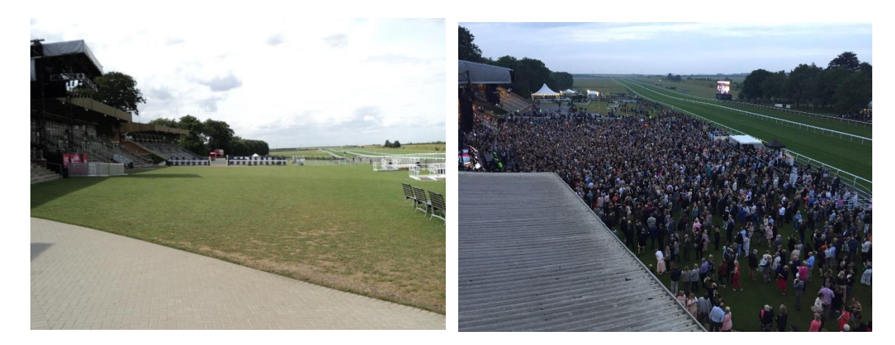
Racecourse side in the Premier Enclosure

Access around the July Course is accessible to people with mobility issues and wheelchair users. There are paved and tarmacked routes covering the venue from the entrances to behind the grandstands. There is a hard standing paved pathway located in front of the Grandstands in the Premier Enclosure. Please note that the rest of the area racecourse side of the grandstand is fine turf. The area for the concert phase can become very congested with people standing to view the concert.