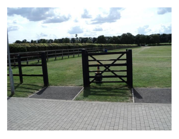
Garden and Grandstand and Paddock Enclosure accessible parking

Garden and Grandstand & Paddock Enclosure parking is situated within the red car park, the blue badge holder parking bays are situated at the front of the car park along the fence line and are accessible through Gate 4 off the Cambridge road. The car park is an open area with a grass surface; it is accessible to a wheelchair user although assistance may be required as there are areas of grass to manoeuvre.