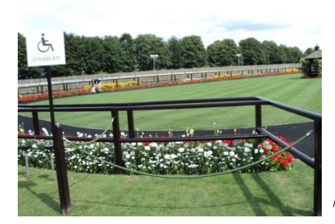
Parade Ring Viewing Area

Parade Ring Viewing : For viewing the parade ring there is sectioned off area on the corner of parade ring side behind Stand 1 and next to the horse walk to the Winner's Enclosure.