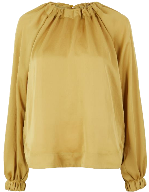
Top & Trousers from a selection, M&S