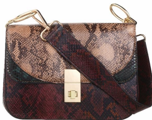
Multi-Snake Bag, £25 Dorothy Perkins