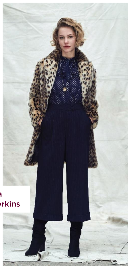
Faux Fur Coat, from a Selection, Dorothy Perkins