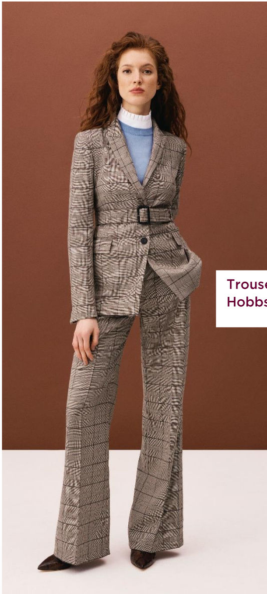
Trouser Suit, from a selection, Hobbs