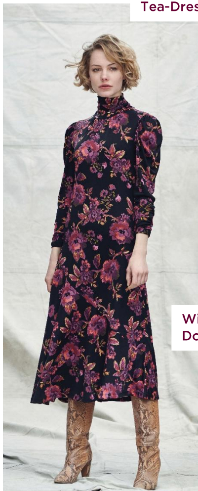
Winter Floral Dress, £35, Dorothy Perkins