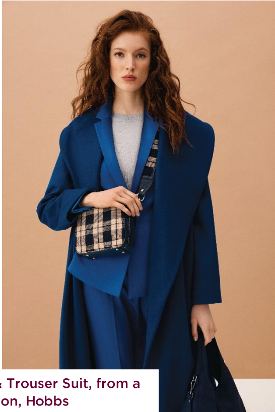
Coat & Trouser Suit, from a selection, Hobbs

The current colour-blocking trend isn't about sharp contrasts. Rather it's about juxtaposing toning shades of differing depths - autumn leaf colours, say, from gold through brown, or complementary teals, blues and greens. Pick a palette that suits your complexion and this look is flattering and effortless.