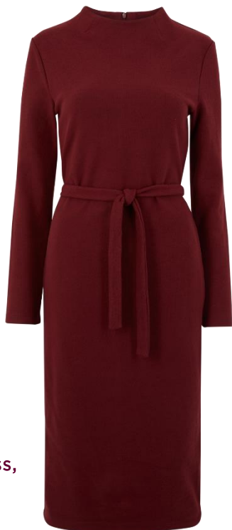
Belted Shift Midi Dress, £35 M&S