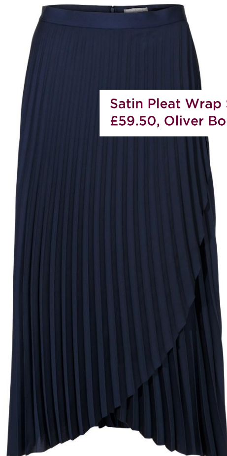
Satin Pleat Wrap Skirt, £59.50, Oliver Bonas