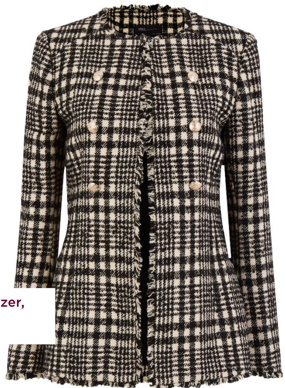
Tweed Checked Longline Blazer, £89, M&S