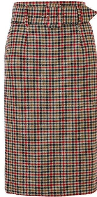
Gingham Pencil Skirt - £39.50, M&S

From dogtooth to gingham to tartan, checked prints are huge for autumn/winter. For the races, the new sharp tailoring is perfect: think wide-legged trousers, slim pencil skirts, neatly waisted jackets. Monochrome and/or autumnal tones hit the right seasonal note.