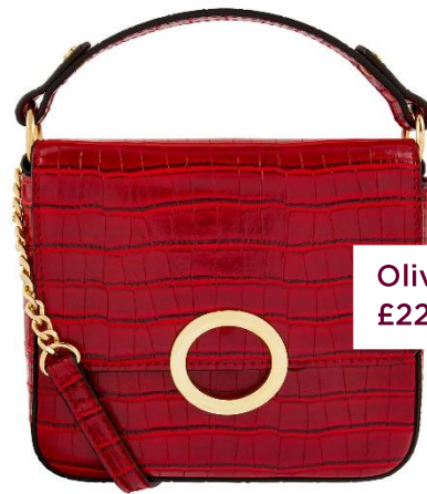
Olivia Ring-lock bag, £22 Accessorize