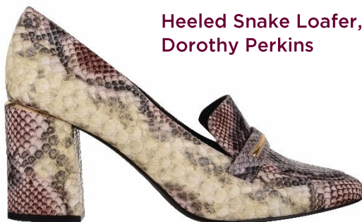
Heeled Snake Loafer, £28, Dorothy Perkins