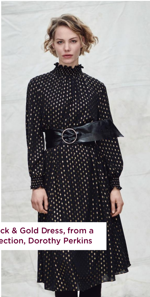
Black & Gold Dress, from a selection, Dorothy Perkins

Proof that classic doesn't have to mean safe or boring, the new season's ladylike look is fiercely feminine rather than girly. Swishy pleats, pie-crust collars and pussycat bows are given a luxe feel via silks, satins, velvet, foils and beading, while Iron Lady bags, belts and heels add structure (and a slightly spiky edge).