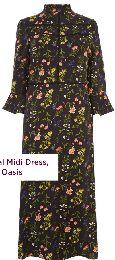
Floral Midi Dress, £56, Oasis

Lines are long, shapes are soft and the palette is plummy. Pair prints reminiscent of Dutch Master Paintings with blocks of plain tan or beige. A touch of animal print on your accessories completes a look that's fashion-forward, but not fashion-slave.