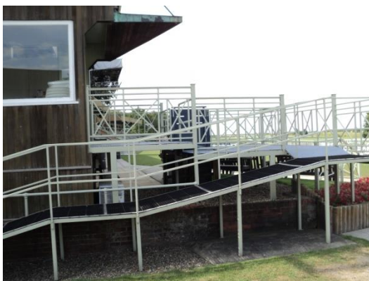
Viewing platform next to integrity tower

One platform is located in the Premier enclosure connected to the right-hand side Stand 2 (Platform A). Access to the platform is from the rear of the grandstand, there is level access up to the slope which has a steep gradient. It is a permanent slope. Alternatively, there is a platform lift available to access this platform. The platform lift is located at the front of the stand, with controls within reach for wheelchair users. This platform is suitable for viewing both the racing and a good side viewpoint for concert events. This platform also has a small undercover section.