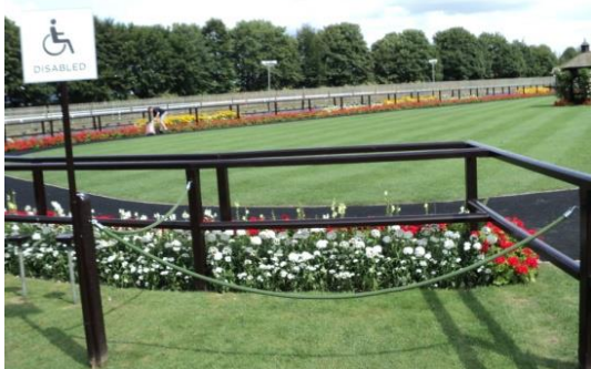
Parade Ring Viewing Area

Parade Ring Viewing: For viewing the parade ring there is sectioned off area on the corner of parade ring side behind Stand 1 and next to the horse walk to the Winner's Enclosure.