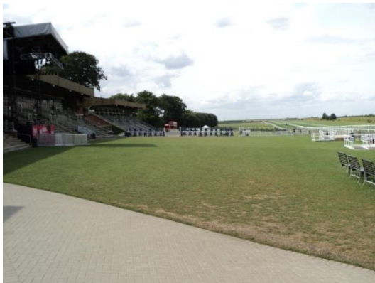
Racecourse side in the Premier Enclosure

Access around the July Course is accessible to people with mobility issues and wheelchair users. There are paved and tarmacked routes covering the venue from the entrances to behind the grandstands. There is a hard standing paved pathway located in front of the Grandstands in the Premier Enclosure. Please note that the rest of the area racecourse side of the grandstand is grassed. The area for the concert phase can become very congested with people standing to view the concert.