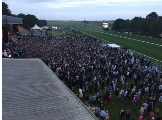
Premier Enclosure Trackside for a concert

Accessible Lifts: Access lifts are located in stands 2 and 3 of the July Course. There is also a lift to provide access to the high-level walkway between Mozart's Bistro and the Dream Ahead Bar. The lifts are accessible through level access and are open to the public for use. There is a maximum capacity of two people at one time (400kg). Each lift has a door width of 800cm and interior dimensions of 100cm x 130 cm (approx.).