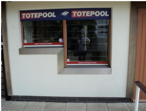
Example lowered Tote service desk

All totes have a lowered counter or exit point to serve customers from ground level. We apologise in advance that The Carroll Restaurant in Grandstand 4 is only accessible via a staircase as there is no lift available in Grandstand 4.