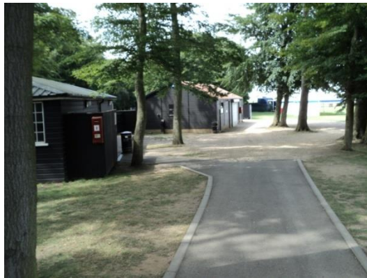
Garden Enclosure Entrance

The Garden enclosure is mainly a grassed area. In order to spectate any of the racing customers must travel across grass and a gravel surface.