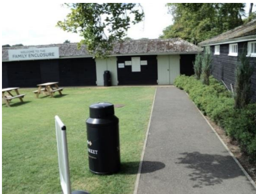
Inside of Garden Enclosure Entrance

The Garden Enclosure entrance is situated at the far end of the venue, and all access is on level ground towards the entry gate. There are however some grass areas to navigate. The main doors are double width (150cm) and open towards you (pull).