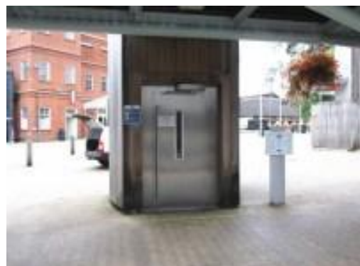
Access lift to high level walkway

There is an accessible lift within Grandstand 3. To access this lift, there is a permanent downward slope located behind the grandstand to the left of the main entrance to the Suffolk Bar. Once inside