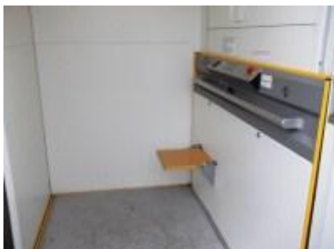
Example interior of access lift

The lift to access the high-level walkway is located in the middle of the Premier Enclosure underneath the walkway. It can be used to access the Mozart's Bistro and the Dream Ahead Bar.