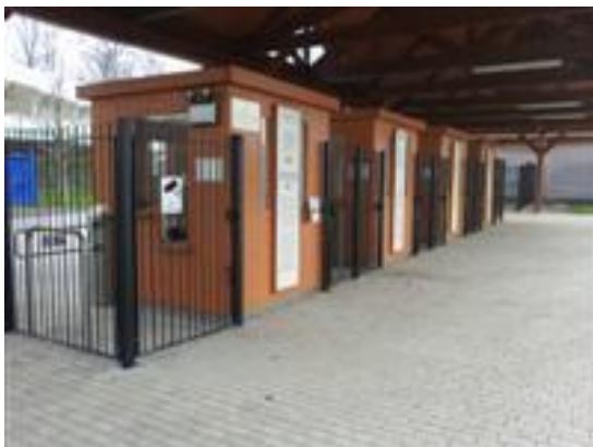
Grandstand & Paddock Entrance

Grandstand and Paddock entrance has level access with a tarmacked surface. The entrance gate has a width of 90cm and an automatically opening barrier. This entrance overcomes the turnstiles and there is a lowered operation window. These access points are situated on the left-hand side of the turnstile entrance. On race days there is a member of staff situated at the entrance to provide assistance. Please note, staff are unable to assist with pushing wheelchairs.