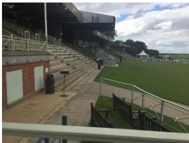
View of Stage from platform A

For music events access to the viewing platforms (A, B and C) is to be arranged in advance by contacting the Customer Relations Team on 01638 675500 (Opt 1). The booking system will be undertaken on a first come, first served basis. Wristbands to access each ramp will be issued when the personal assistance ticket is collected from the Free Pass Office. Admission onto the platforms on the day without prior booking cannot be guaranteed.