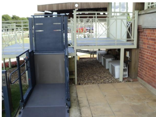
Accessible lift to viewing platform next to integrity tower

A second platform is located in Premier enclosure trackside in front of the Stand 2 (Platform B). Access to the platform is via a slope with a moderate gradient to the level platform.