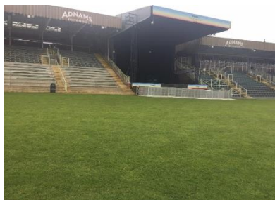
View of Stage from platform B