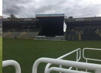
View of stage from platform C

The platforms can accommodate wheelchairs/scooters that are within the dimensions 700mm wide by 1200mm long. If a wheelchair/scooter is large than this dimension this must be highlighted at the time of booking the platform place.