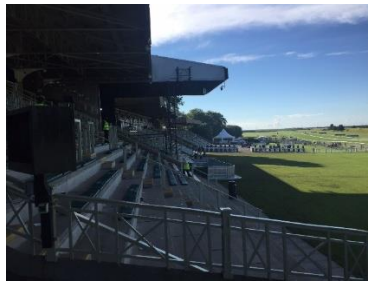
View of Stage from Area D

Spaces on the platforms and within the reserved areas include one accessible visitor with one accompanying personal assistant. No other visitors can be accommodated on the platform/in the areas.