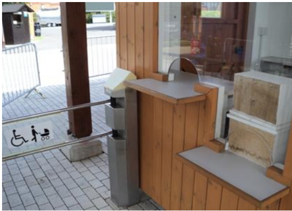
Lowered counter at Premier 2 Grandstand & Paddock entrance