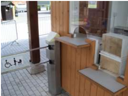
Grandstand & Paddock entrance

Premier Entrance 2 has level access with a tarmacked surface. The main doors are single width (90cm) and open automatically. There is a lowered operation window. These access points are situated on the left hand side of the gate entrance. On race days there is a member of staff situated at the entrance to provide assistance.