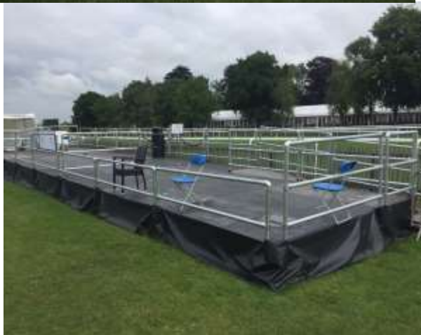
Viewing platform (C)