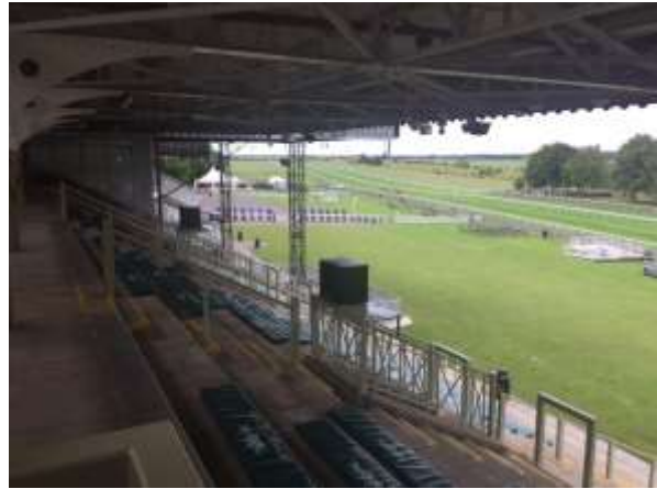
View of Stage from Area E

Spaces on the platforms and within the reserved areas include one disabled visitor with one accompanying personal assistant. No other visitors can be accommodated on the platform/in the areas.