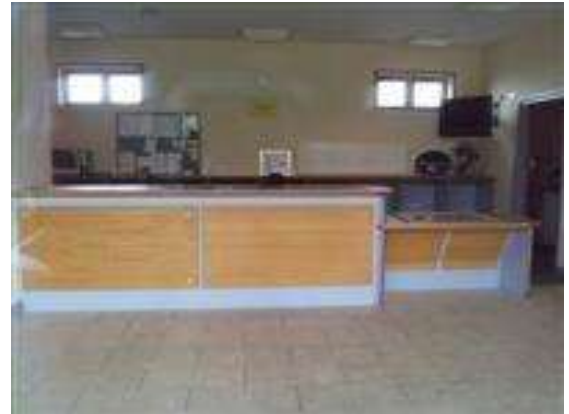
Inside Course Office

Accessible Toilets: There are three accessible toilets located around the perimeter of the Grandstand and Paddock enclosure. One is located next to the Soviet Star Bar, one opposite the Height of Fashion bar and another opposite the Royal Academy bar and next door to the Fish & Chip shop. All three accessible toilets have doors opening outwards (pull) with a width of 85cm. There is clear manoeuvring space in each one with minimum dimensions of 155cm x 220cm.