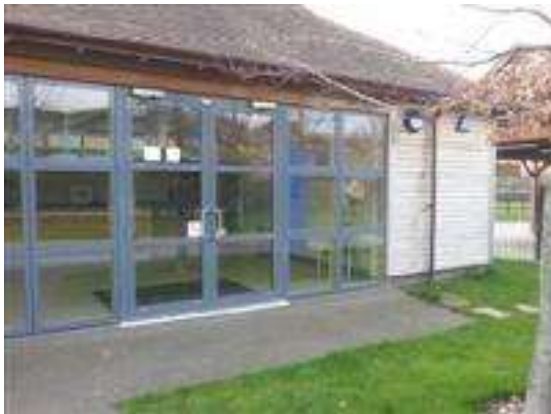
Course office Entrance

The course office/information point is located in the Grandstand & Paddock Enclosure, beside Premier Entrance 2. There is level access and a tarmacked surface around it. The main doors are double width (180cm) and open towards you (pull). On race days there is a member of staff stationed there to provide assistance. The reception desk is located 3m away from the main doors with level access on a tiled surface. The reception desk is at medium height with a lowered operation section to the right hand end.