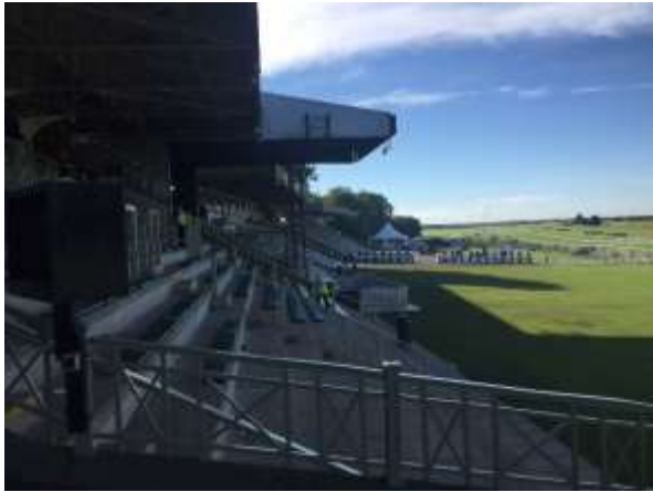
View of Stage from Area D