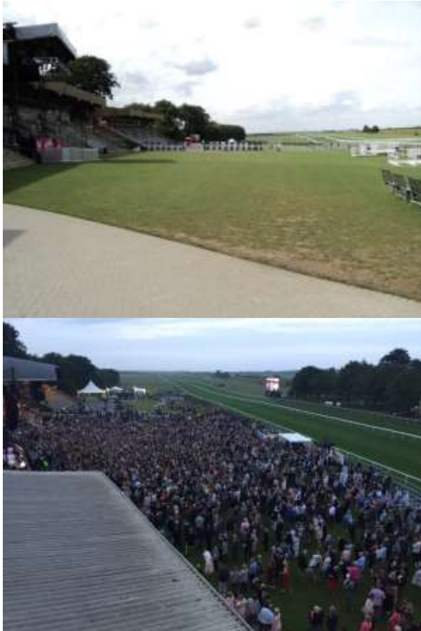
Racecourse side in the Premier Enclosure a concert

the entrances to behind the grandstands. There is a hard standing paved pathway located in front of the Grandstands in the Premier Enclosure. Please note that the rest of the area racecourse side of the grandstand is grassed. The area for the concert phase can become very congested with people standing to view the concert.