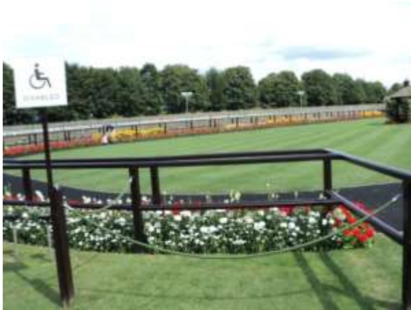
Parade Ring Viewing Area

Viewing Platform: There are two concrete viewing platform within the Grandstand & Paddock Enclosure. Both platforms are trackside of Grandstand 4 and suitable for race viewing only. Access is via a grass surface.