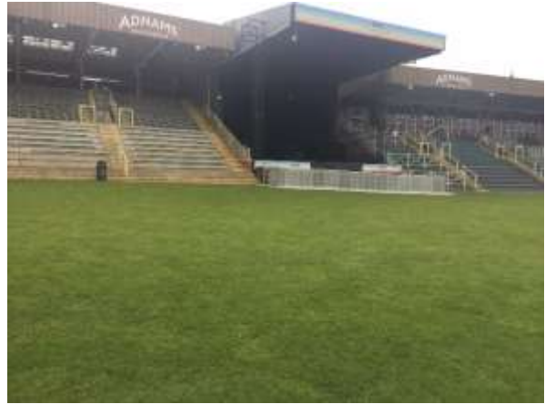
View of Stage from platform B