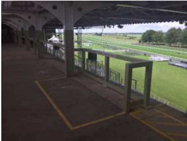
Viewing Area E from top of Stand 2 (Premier Enclosure)

The lift to access the high level walkway is located in the middle of the Premier Enclosure underneath the walkway. It can be used to access the Stravinsky's Bistro and Mozarts Restaurant.