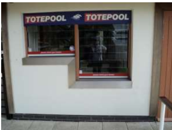
Example lowered Tote service desk

We apologise in advance that The Carroll Restaurant in Grandstand 4 is only accessible via a staircase as there is no lift available in Grandstand 4.