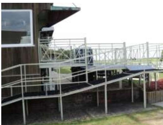
Viewing platform next to integrity tower

One platform is located in the Premier enclosure connected to the right hand side Stand 2 (Platform A). Access to the platform is from the rear of the grandstand, there is level access up to the slope which has a steep gradient. It is a permanent slope and assistance is on hand if required. Alternatively there is a platform lift available to access this platform. The platform lift is located at the front of the stand, with controls within reach for wheelchair users. This platform is suitable for viewing both the racing and a good side viewpoint for concert events. This platform also has a small undercover section.