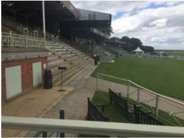
View of Stage from platform A