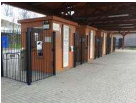
Grandstand & Paddock Entrance

Grandstand and Paddock entrance has level access with a tarmacked surface. The entrance gate has a width of 90cm and an automatically opening barrier. This entrance overcomes the turnstiles and there is a lowered operation window. These access points are situated on the left hand side of the turnstile entrance. On race days there is a member of staff situated at the entrance to provide assistance.