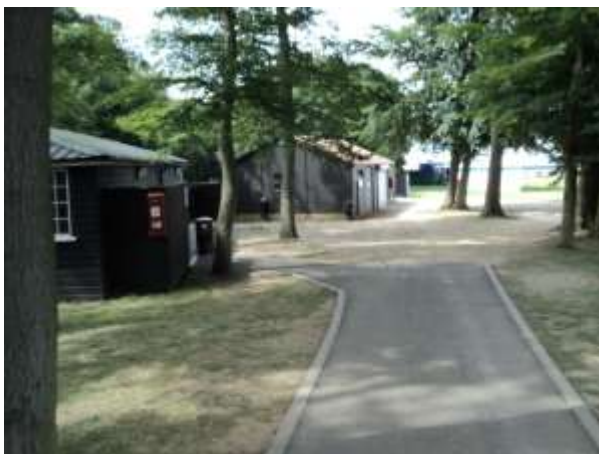
Inside of Garden Enclosure Entrance

The Garden enclosure is mainly a grassed area. In order to spectate any of the racing customers must travel across grass and a gravel surface.