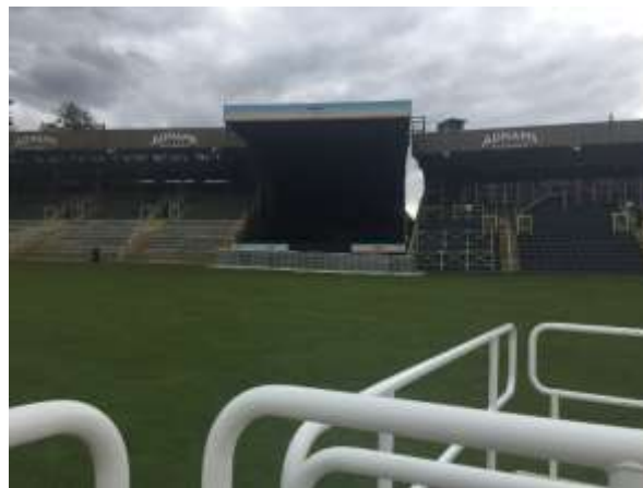
View of stage from platform C

The platforms can accommodate wheelchairs/scooters that are within the dimensions 700mm wide by 1200mm long. If a wheelchair/scooter is large than these dimension this must be highlighted at the time of booking the platform place.