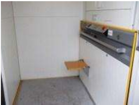
Example interior of access lift walkway

The lift to access the high level walkway is located in the middle of the Premier Enclosure underneath the walkway. It can be used to access the Stravinsky's Bistro and Mozarts Restaurant.