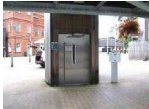
Access lift to high level

There is an accessible lift within Grandstand 3. To access this lift, there is a permanent downward slope located behind the grandstand to the left of the main entrance to the Adnams Southwell Bar. Once inside the access lift can be found on the right hand side. This lift provides access to all levels of Stand 3, including the accessible toilet on the first floor, and the private boxes on level 2.