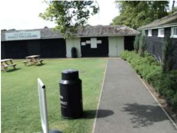
Garden Enclosure Entrance

areas to navigate. The main doors are double width (150cm) and open towards you (pull).