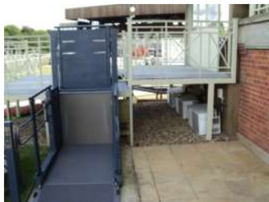
Accessible lift to viewing platform next to integrity tower

A second platform is located in Premier enclosure trackside in front of the Stand 2 (Platform B). Access to the platform is via a slope with a moderate gradient to the level platform.