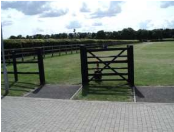
Garden and Grandstand and Paddock Enclosure accessible parking

Garden and Grandstand & Paddock Enclosure parking is situated within the red car park, the blue badge holder parking bays are situated at the front of the car park along the fence line and are accessible through Gate 4 off the Cambridge road. The car park is an open area with a grass surface; it is accessible to a wheelchair user although assistance may be required as there are areas of grass to manoeuvre.