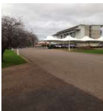
View from the Grandstand & Paddock Entrance looking towards the Boulevard Area, Hyperion lawn on the left and the Millennium Grandstand.

This entrance leads you to the Boulevard area incorporating the Information Desk, Food Court, Paddock, Hyperion Lawn and Millennium Grandstand. The area is tarmac with a medium incline toward the Grandstand area.