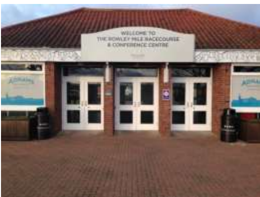
Premier Enclosure Entrance.

Customers with both Premier Enclosure and Grandstand and Paddock Enclosure tickets can access via the Premier Entrance. Grandstand and Paddock Enclosure customers will have to transverse an area of closely mown grass should they wish to use the Premier Entrance to access the Grandstand and Paddock Enclosure.