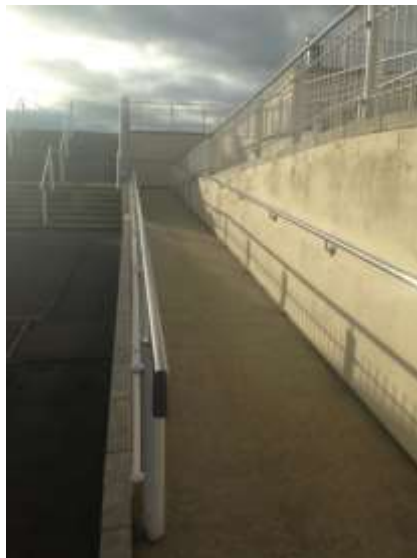
Access from food court to view racecourse

Information Point: The Information Point is located within the Boulevard area 60m inside the Grandstand and Paddock Entrance Turnstile. Ticket upgrades can be brought from here along with race cards. Lost property is reported here and RADAR keys can be obtained. There is a lower level window for wheelchair users. On race days there is a member of staff on hand to assist with all enquiries.