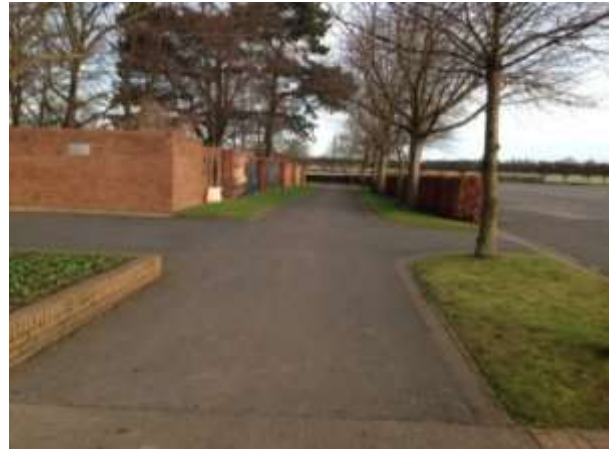
Disabled Parking Bays outside Premier Entrance & route to Premier Entrance from these parking bays

Disabled blue badge parking is also available outside the Grandstand & Paddock entrance. This parking area is for Grandstand & Paddock, Garden Enclosure customers. This parking area is situated to the rear of the venue, directly outside the Grandstand and Paddock entrance. The car park is an open area with mown grass surface; it is accessible to a wheelchair user although assistance may be required as there are areas of grass to manoeuvre. From this parking bay it is approximately 20m to the Grandstand & Paddock entrance and 150m to the Garden Enclosure entrance.