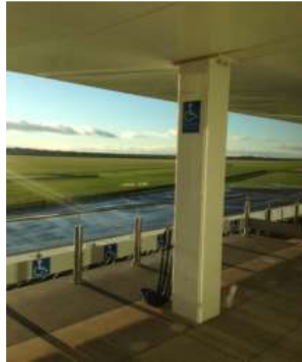
2 nd Floor Millennium Grandstand viewing

There is also a viewing area reserved for customers with disabilities on level 2 of the Millennium Grandstand. This is access via the Millennium Bar and gives a very good view of the racecourse. Please be aware both these areas can become heavily congested on feature racedays.