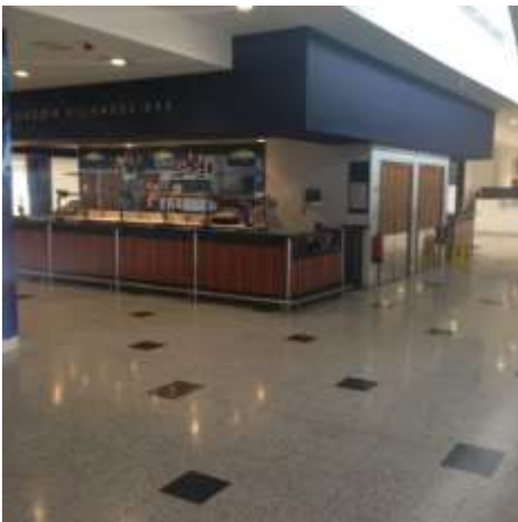
Ground floor Millennium Grandstand low level counter

The Devil's Dyke Restaurant on the ground floor of the Grandstand is accessible to all on a level surface. The Frankel Lounge has a small door threshold on the door ledge, assistance is available on request. All the food court units are positioned on a flat tarmac surface within the Boulevard area.