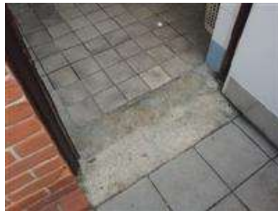
Premier Courtyard Toilet (Unisex)