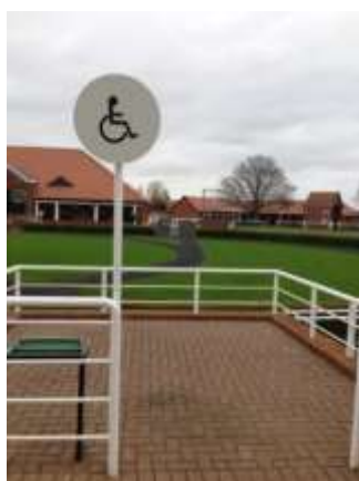
Access ramp to the Frankel Lounge