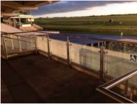
Level 1 Millennium Grandstand viewing area

On level 1 of the Millennium Grandstand a viewing area is reserved for customers with disabilities. This area is accessed via double doors from the carpeted bar area. Please be aware that this area can become heavily congested on feature days.