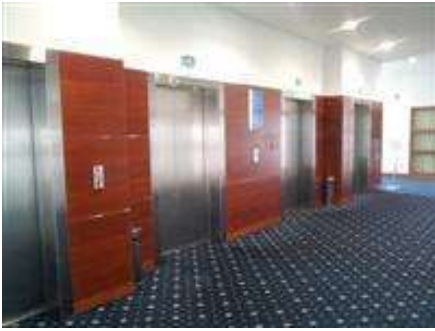
Lifts in ground floor foyer of the Millennium Grandstand leading to all floors

The Head On Stand is accessed via a standard lift located 5 metres from the entrance of the Head On Stand. This lift provides access to the Royal Box, Guineas Suite and Runners Lounge on the first floor of the Stand, and the Private Boxes and the Thoroughbred Lounge on the second floor. Please note that only wheelchairs less than 70cm can access the Runners and Thoroughbred Lounge, for further details please contact the Customer Relations team. The clear door width is 77cm and the dimensions of the lift are 100cm x 130cm. The lift does have a visual floor indicator and an audible announcer. The controls are at a convenient height for a wheelchair user and the controls are both tactile and Braille marked.