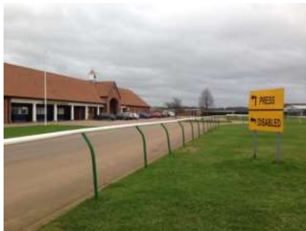
Signposted Disabled Parking area outside the Grandstand & Paddock entrance

Coach Parking: The coach park is located approximately 60m from the Grandstand & Paddock entrance. The ground surface is closely mown grass.