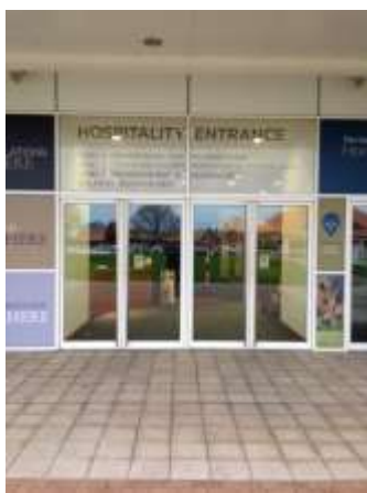
Hospitality Entrance Paddock Side of Millennium Grandstand

Customer Relations Desk (Hospitality Entrance): The Hospitality Entrance is located Paddock side of the Millennium Grandstand. There are 2 double inward and outward opening doors with a width of 178 cm. There is no level change however there is a metal threshold and the surface changes from paving to carpet. There is a member of staff positioned at the Customer Relations desk on race days and conference days to provide assistance.