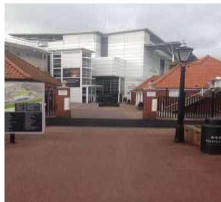
Walkway from Premier Entrance into Racecourse

Grandstand & Paddock Entrance: The Grandstand & Paddock entrance is located at the far end of the venue, at the end of the racecourse drive. All access is on level ground towards the entry gate. The gate is 100 cm wide with no level changes. The counter window is 102 cm from ground level. On race days there is a member of staff situated at the entrance to provide assistance.