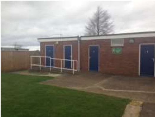
Garden enclosure toilets

There are clearly signed and easily accessed disabled facilities within the Garden Enclosure. The toilets are located to the right hand side as you enter the Garden Enclosure. The toilet is not for the sole use of disabled people as this facility also has a baby change unit. There is a concrete, permanent ramp of 2 metres with an easy gradient. This is a unisex facility. The door opens outwards and is 96cm wide. There are 4 hand rails and a drop down safety bar. There is plenty of transfer space within the cubicle which has dimensions of 110cm x 135cm. There is an emergency alarm within this facility.