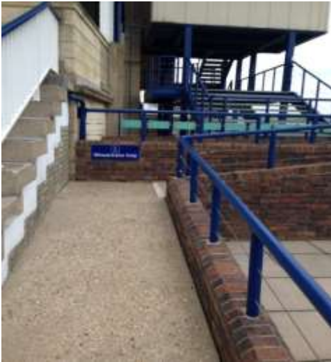
Head On Stand ramp and viewing