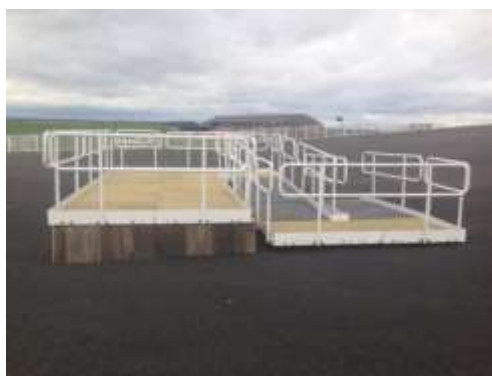
Grandstand & Paddock enclosure viewing platform