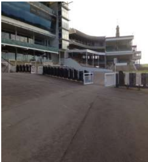
Racecourse side of the Grandstand