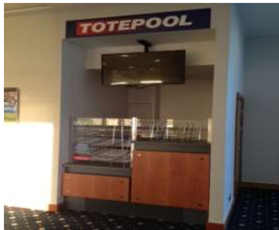
Tote Low level counter